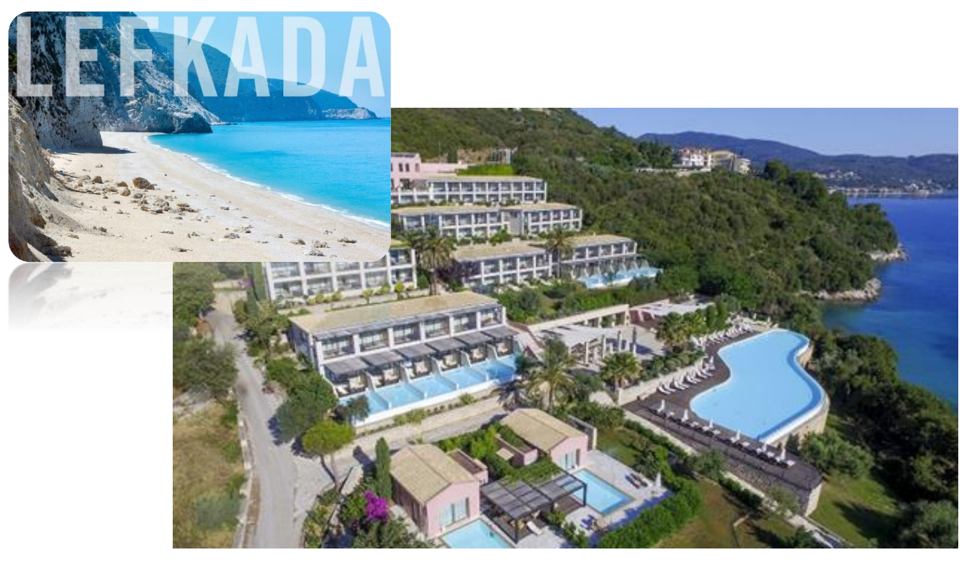
Ionian Blue Hotel Bungalows & Spa Resort Nikiana, Lefkada island, Greece